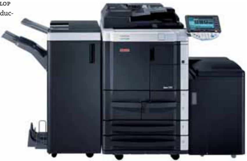
ineo 751 with booklet finisher FS-610, and the large capacity tray LU-405