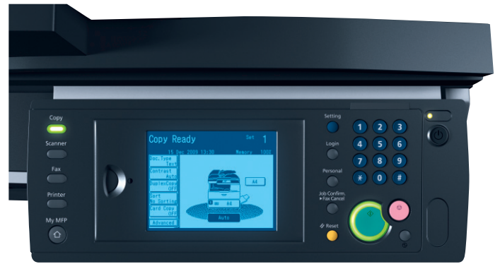
D 240F Touch-Screen-Display, easy to use and functional.

Purchasing a compact b/w device often means you have to compromise on quality. Here, the D 240F is a pleasant exception. The smaller and finer particles of its polymerized toner produce office documents of high quality, even for small print. Thanks to a scan-to-print function, this multifunctional device even allows scanned documents to be sent direct to the nearest colour system and printed out in colour. In this way, departmental users enjoy all the advantages of a compact b/w system but can fall back on colour, if required.