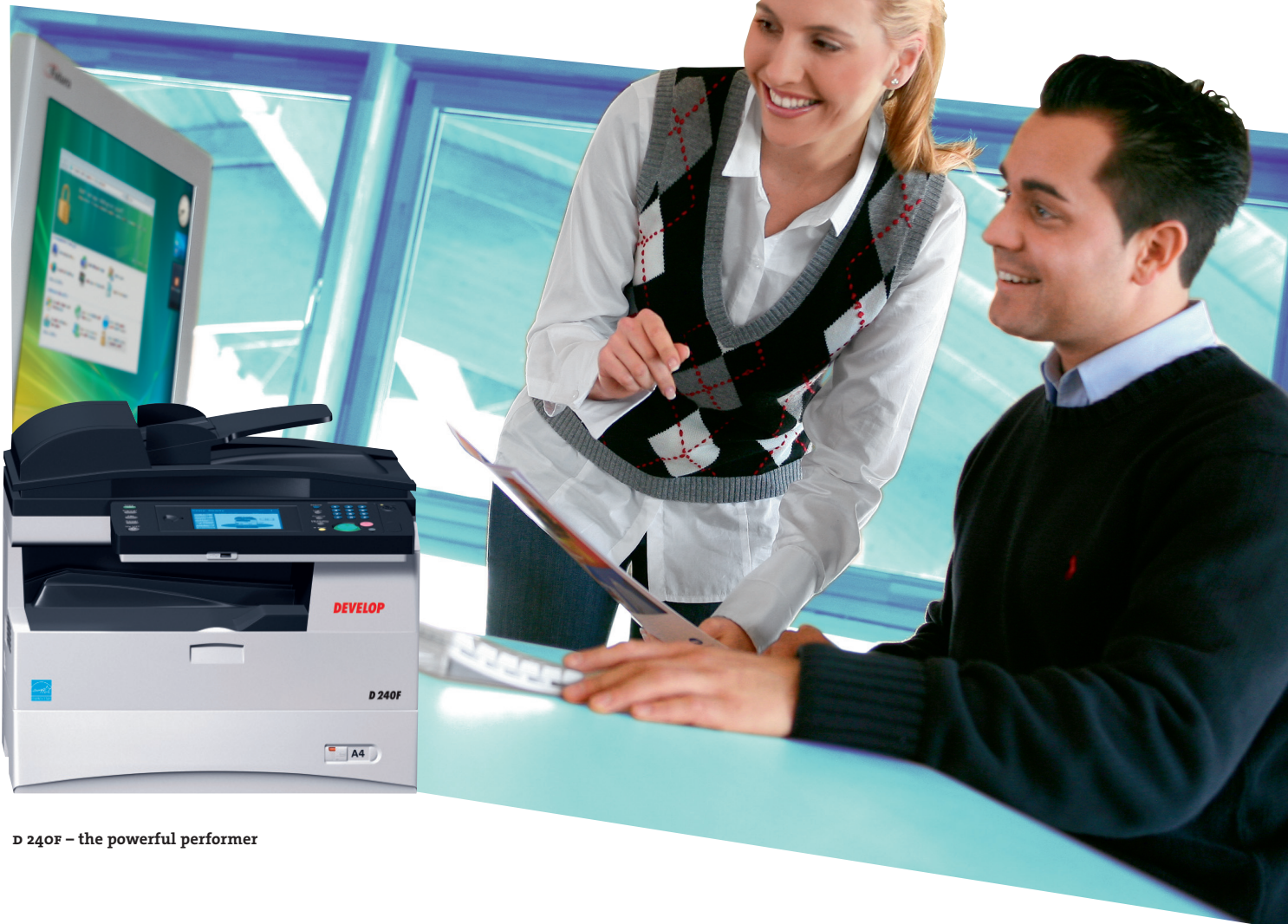
D 240F – the powerful performer